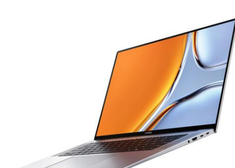
Huawei MateBook X Pro