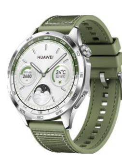
HUAWEI WATCH GT 4