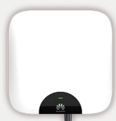
SUN2000L Inverter 7 years standard warranty