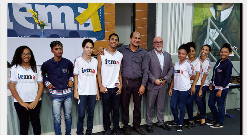
Initiated ICT Competition