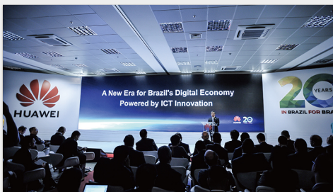
20 Years' Commitment