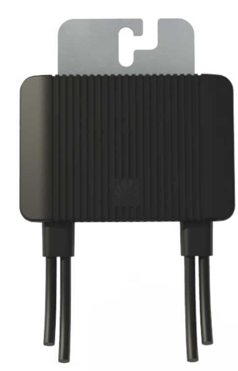
Smart PV Optimizer