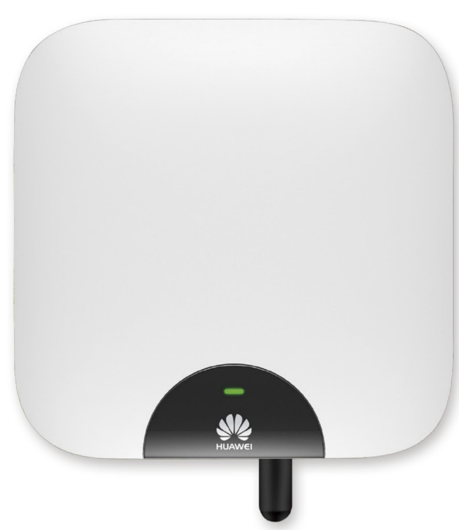
Smart Energy Center

* Functions marked by "*" require Smart PV Safety Box and full Smart PV Optimizer.