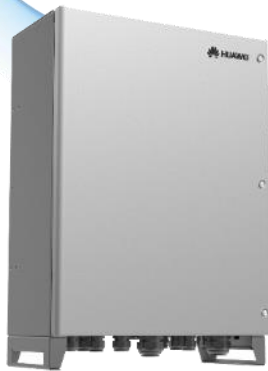
Without SmartPID2000 module