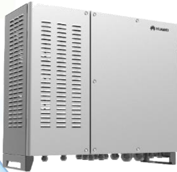
With SmartPID2000 module