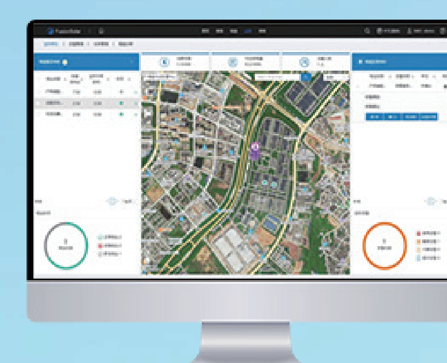
FusionSolar Management System