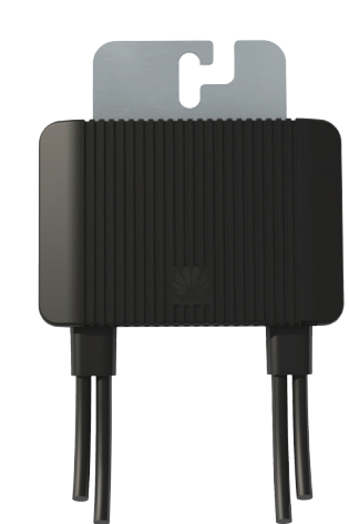
Smart PV Optimiser