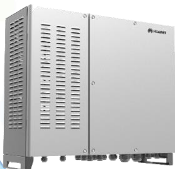
With SmartPID2000 module