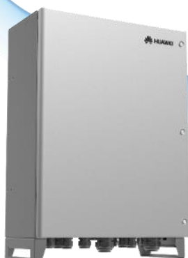
Without SmartPID2000 module

SmartACU2000B (Smart Array Controller) is a powerful integration of PV array communication and other smart functions. What's more, it supports 1000V/1100V/1500V DC system perfectly.