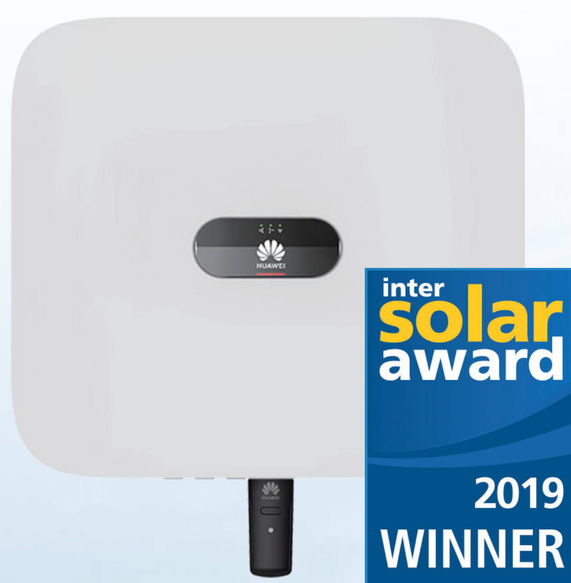
SUN2000-3-10KTL-M0*/M1 *not support optimizer